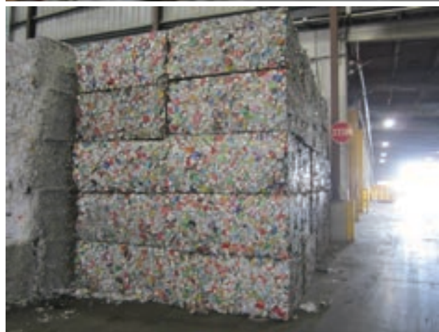
Crushed and banded aluminum cans