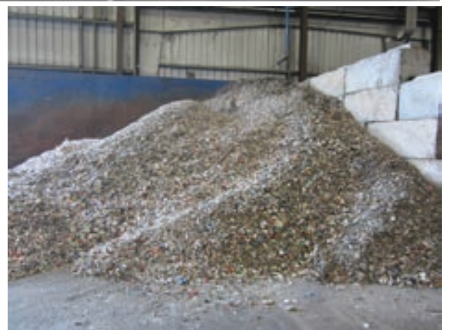
Shards of multi-colored glass will be sent to Gallo Glass Company