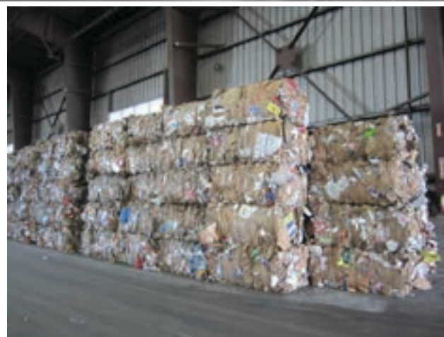
Bundled OCC (Old Corrugated Cardboard)